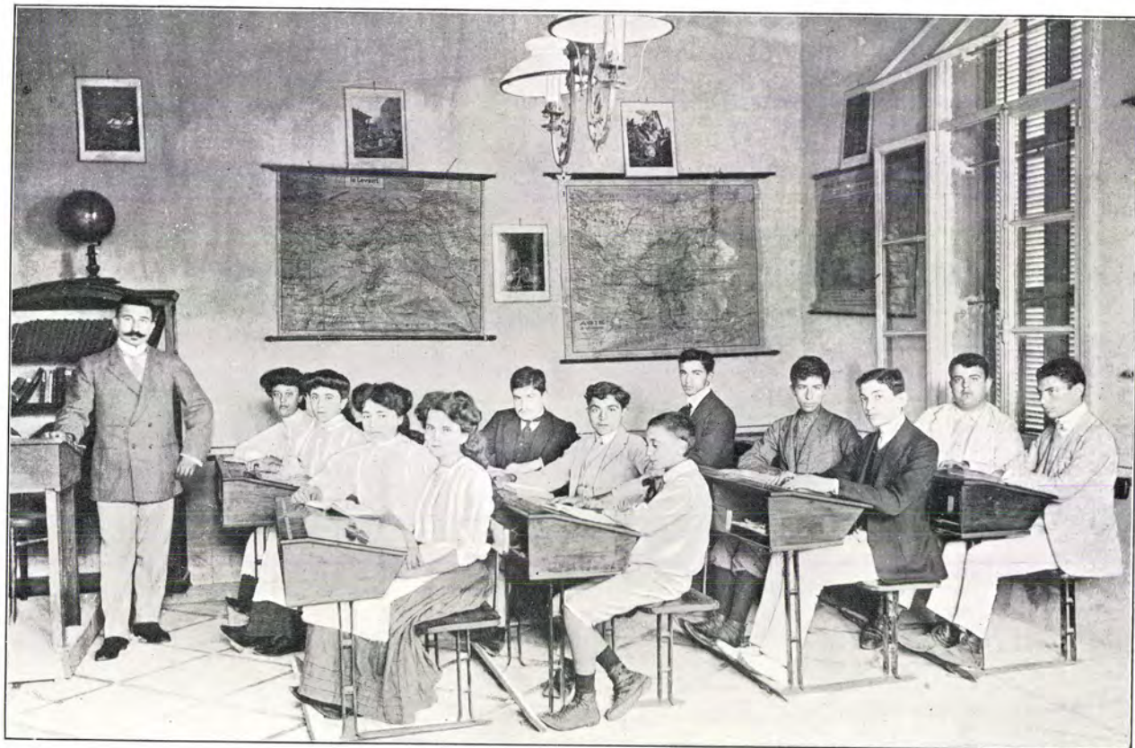
ADVANCED CLASS AT THE BEYROUT SCHOOL.