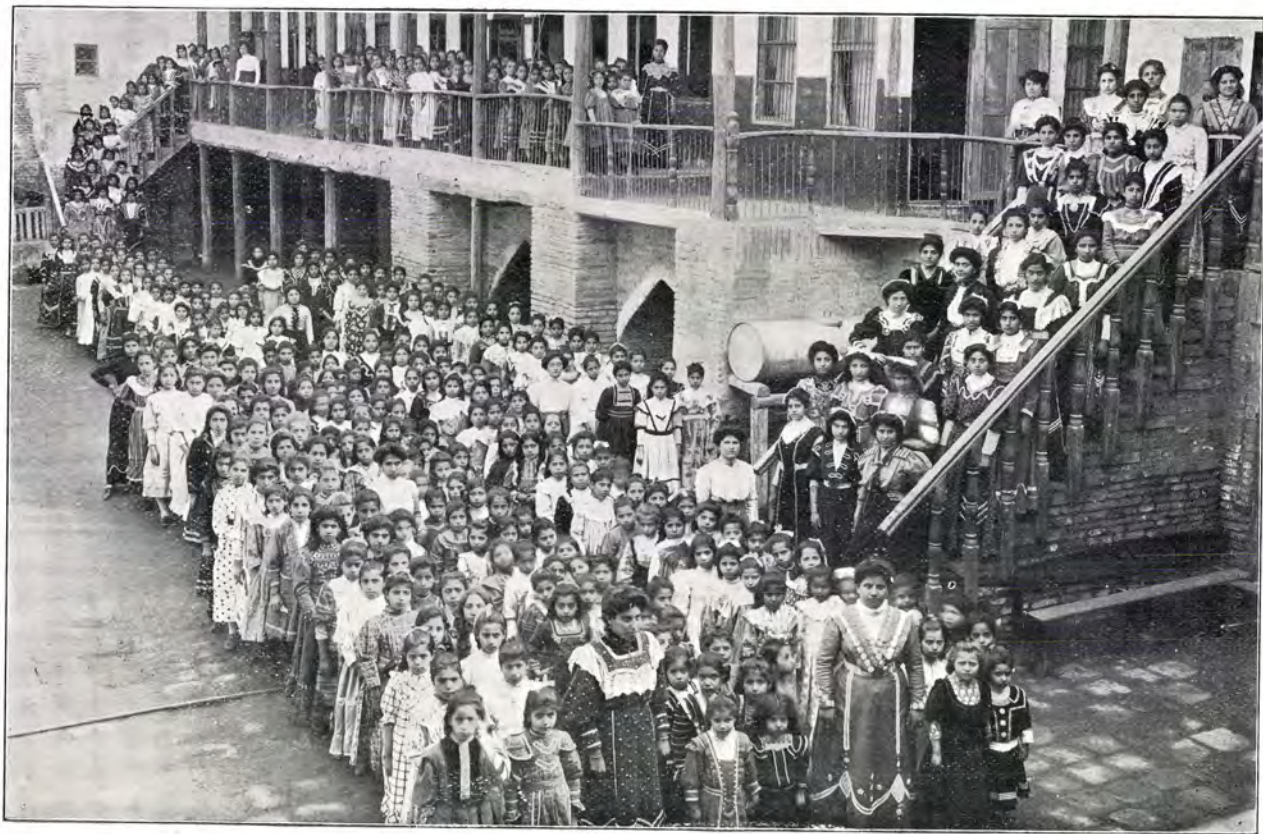
PUPILS OF GIRLS' SCHOOL AT BAGDAD.