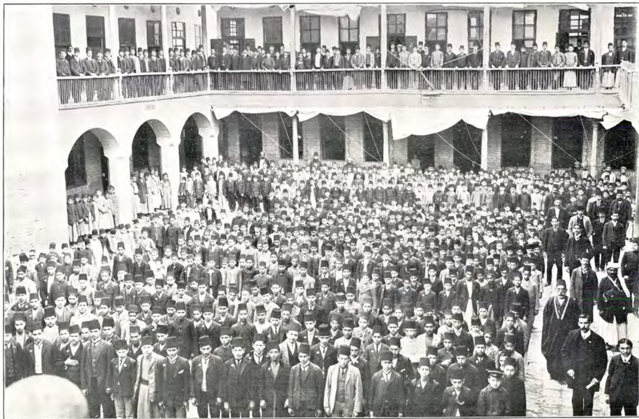
PUPILS OF BOYS' SCHOOL AT BAGDAD.